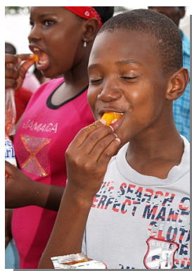
Mmm...good food for sale!

Gifts to the work of the Fellowship, which would be highly appreciated, can be sent to the National Office or lodged into our accounts. Bank of Nova Scotia (HWT) account:# 2948-10 Or NCB (HWT) account # 30-5028835