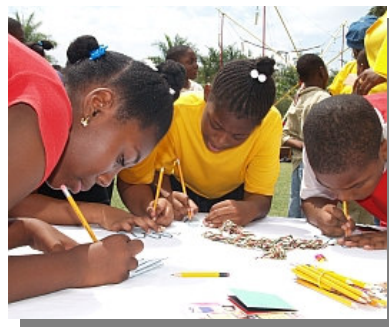
Writing prayer requests at Fun in the Son