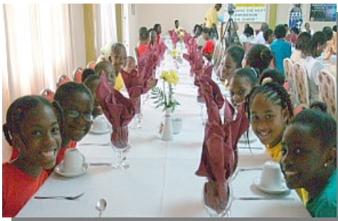
Happily waiting for their breakfast – some members of the Children's Bible Club Choir.