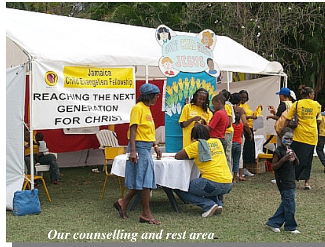
Our counselling and rest area.